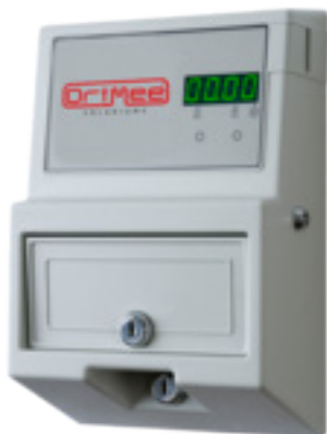
Digital Token Operator