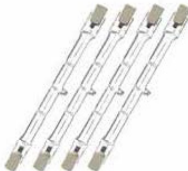
4-Pack Infrared Bulbs